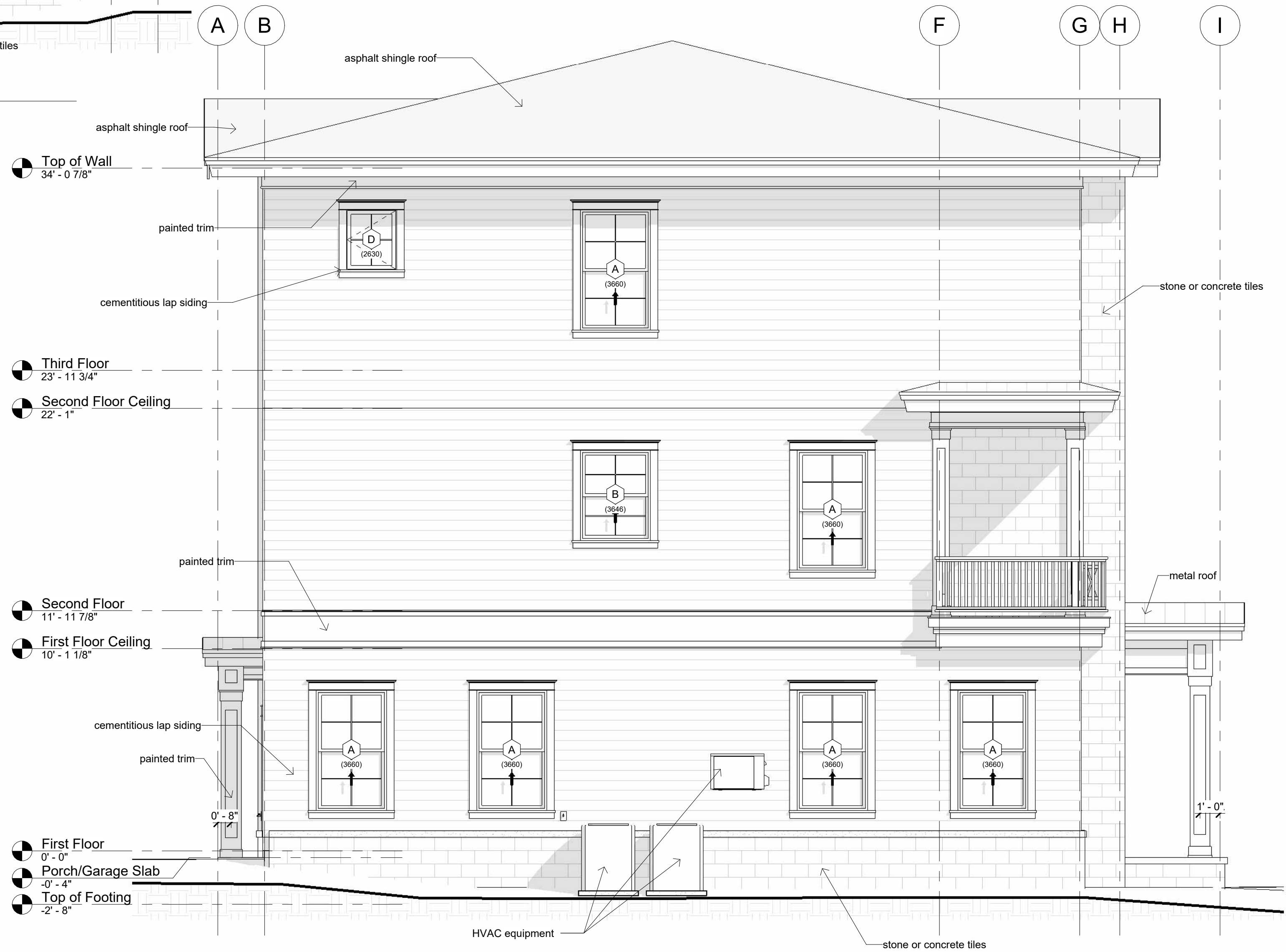
West Elevation 1/4" = 1'-0"