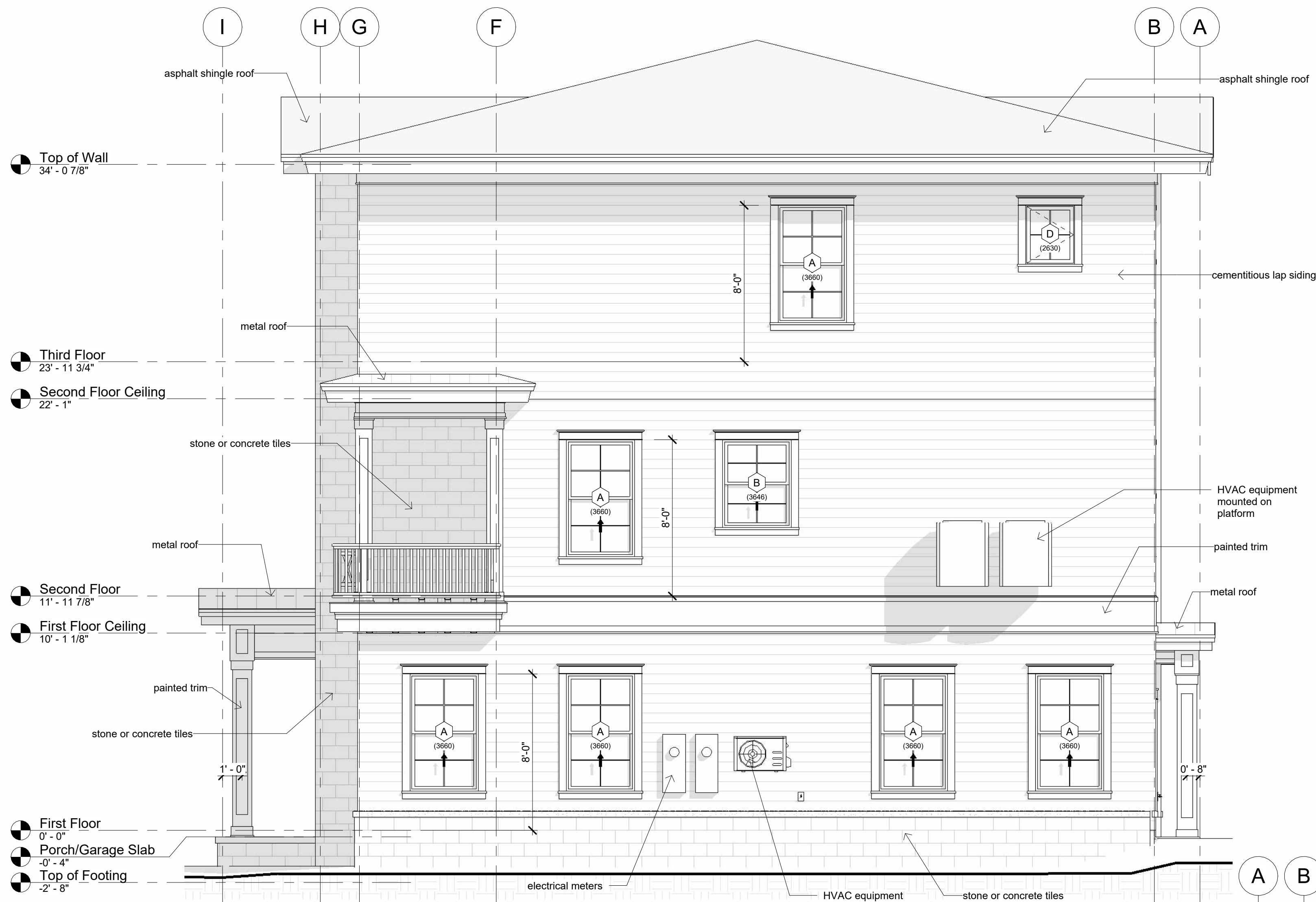
East Elevation 1/4" = 1'-0"